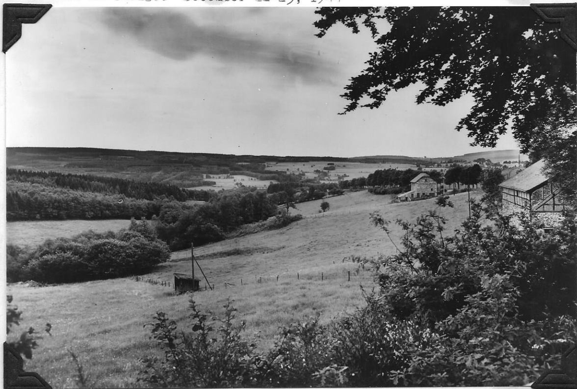
Panorama view of La Gleize, the cemetery of the 1st Panzer "SS" Division, cut off by the 30th Division. The German toll: 39 tanks 70 half-tracks, 30 other vehicles and 33 artillery pieces.